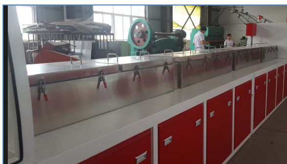
Heating Temperature Control Part